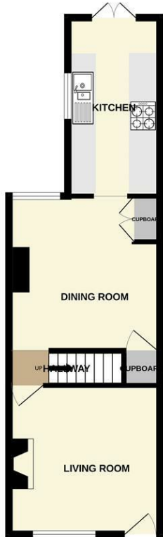
GROUND FLOOR 413 sq.ft. (38.3 sq.m.) approx.